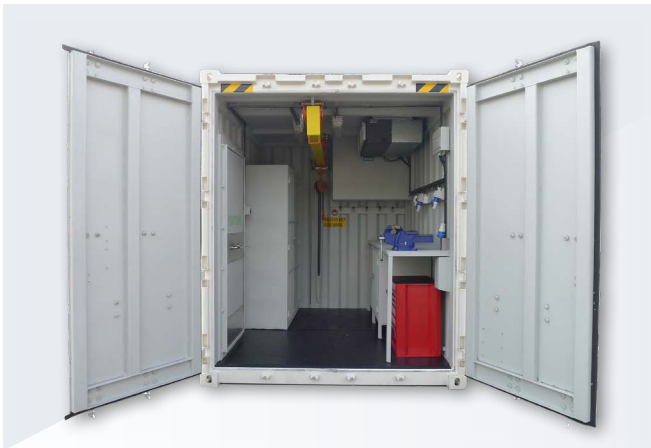
10ft Workshop container - open