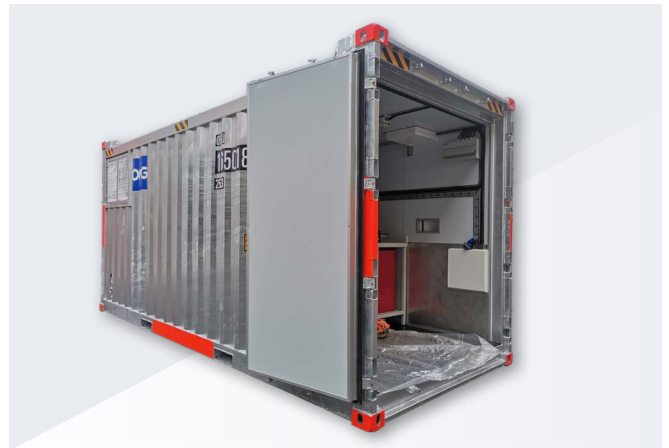
20ft Workshop container - open